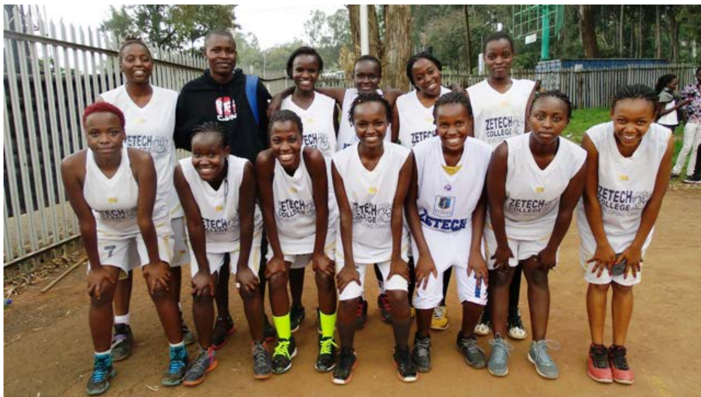
The Sparks pose after beating Africa Nazarene University during the Nairobi Basketball games.