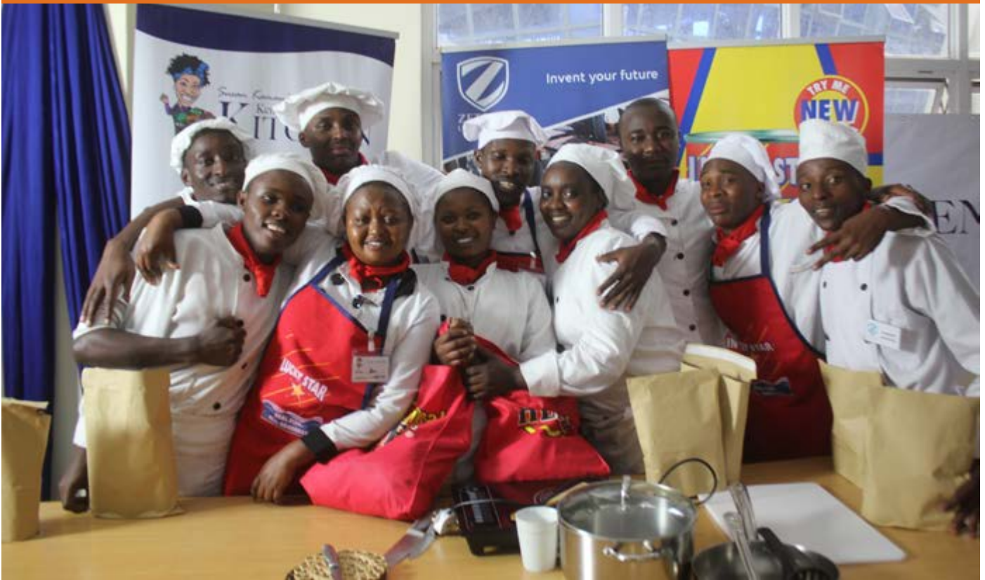
The Zetech School of Hospitality students pose after the challenge at Thika Road Campus.