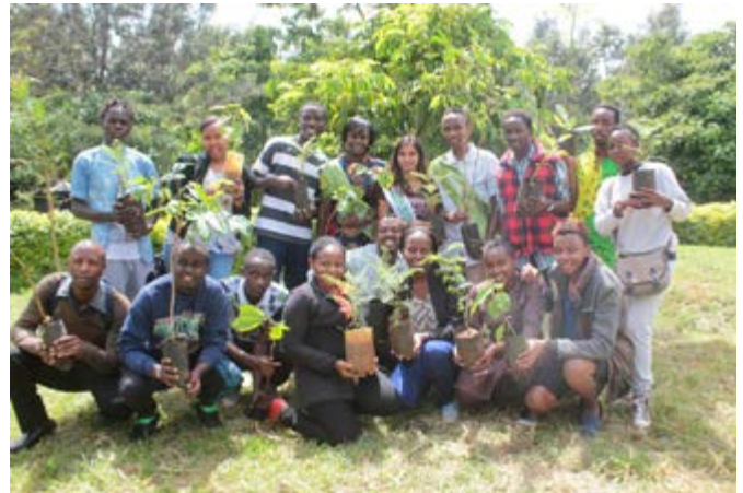
Some of the participants with their trees