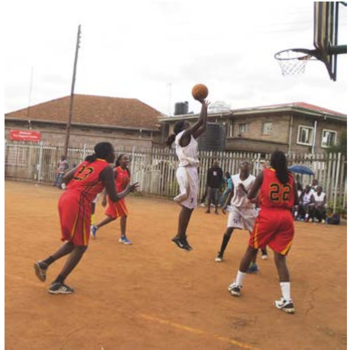
Sparks in action during the game