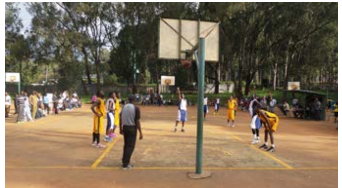
Zetech Sharks with a free throw from a technical foul.