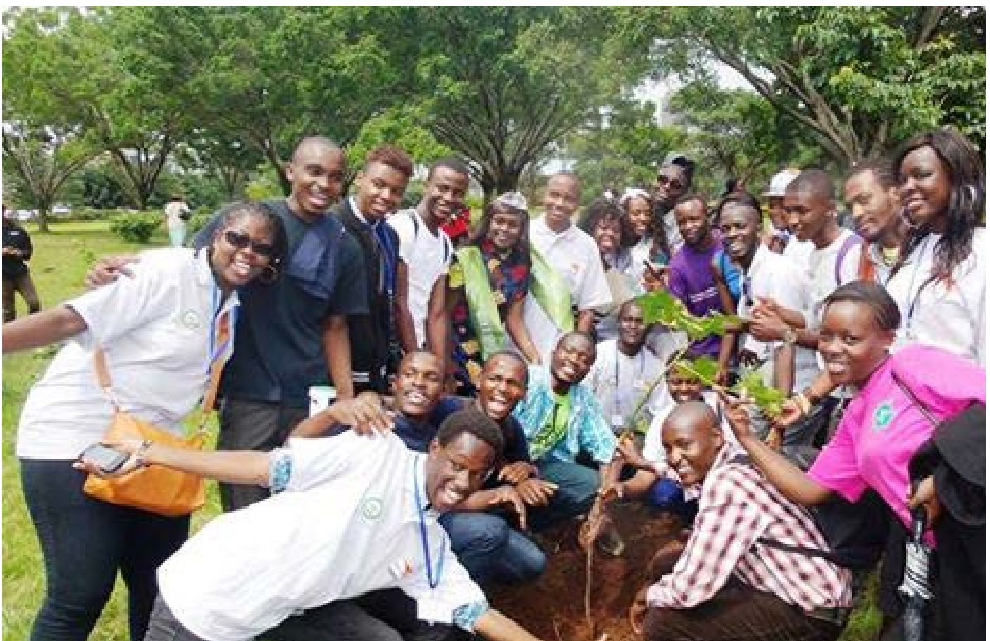
The participants pose for a photo with the planted trees at Uhuru Park